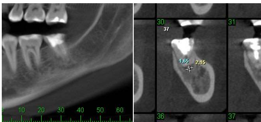
Figure 2 - Tomography after 6 months of the tooth 37. Measurement of repair of the periradicular lesion at the depths VP (vestibular-palatine) and IA (incision-apical).